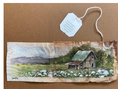
Teabag painted in watercolour