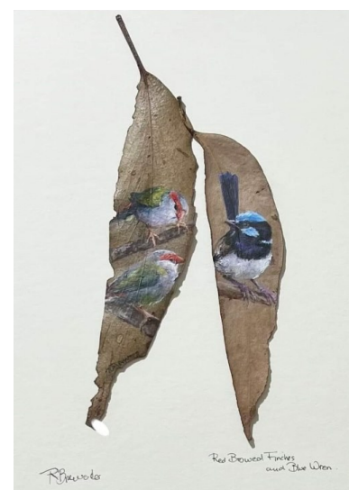
Gumleaf by Regina Brewster

Use small acid free scrapbook mounts to mount your work . These are tiny double sided foam pieces. Available from