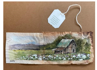
Teabag painted in watercolour