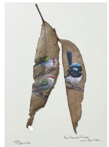
Gumleaf by Regina Brewster

Use small acid free scrapbook mounts to mount your work . These are tiny double sided foam pieces. Available from craft stores like Spotlight